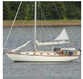
Finished Anchor Sail