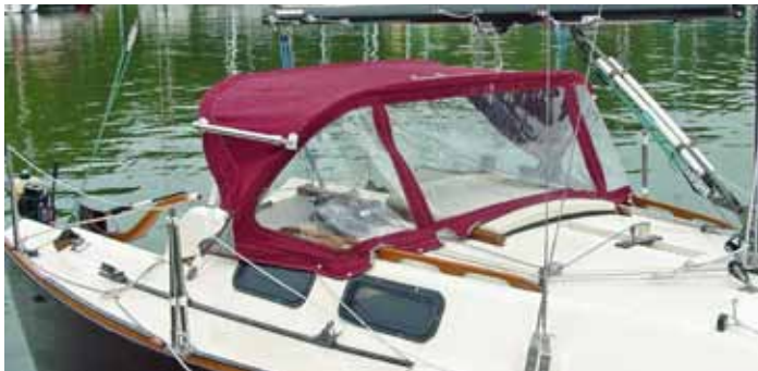
Finished Grab Rail

A grab rail is easy to assemble and contributes to greater safety on the water. This kit allows for a maximum handrail length of 30.5". Grab rails can be placed between two bows on the side of a dodger or bimini or parallel to a bow (forward or aft ends).