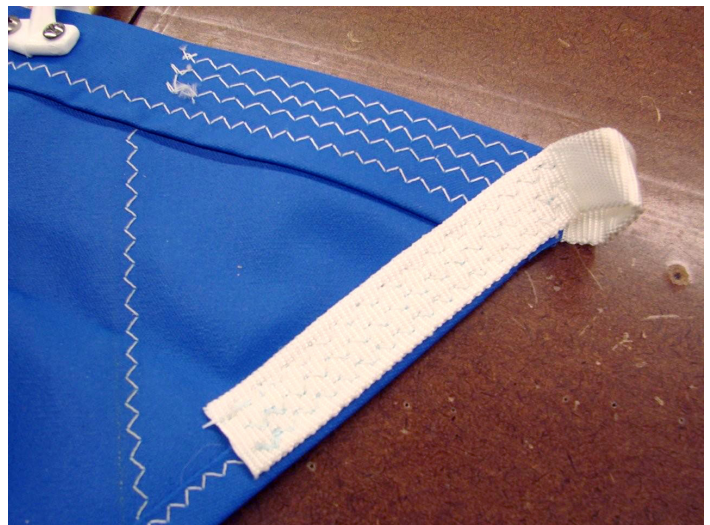
Anchor Riding Sail with Webbing Loop at the Corner